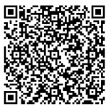
Agrozen Laboratory Authenticity QR Code