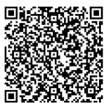
Agrozen Laboratory Authenticity QR Code